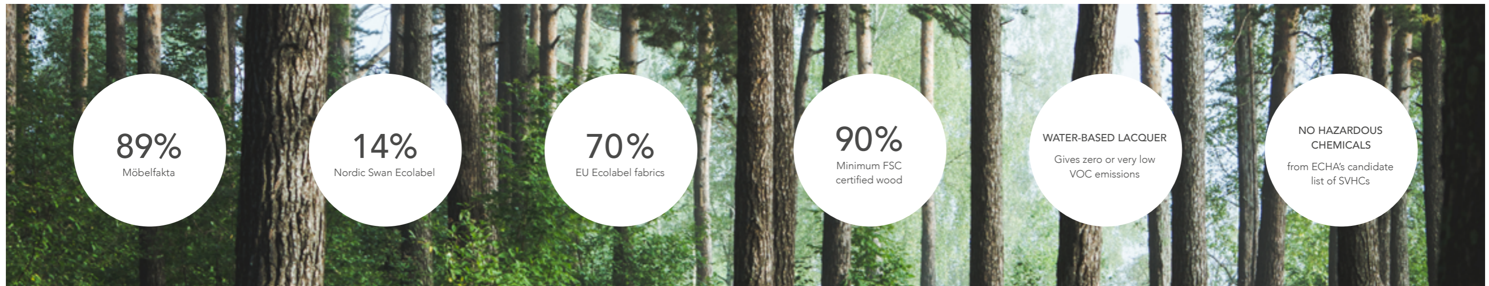
Möbelfakta shows the percentage of total sales. Other figures on this spread show the percentage of quantities.

ENVIRONMENTAL PRODUCT DECLARATION (EPD) provides product-specific environmental information, including content, emissions, and impact throughout its life cycle. Independently verified and published on the international EPD system, EPDs help guide our sustainability efforts. EFG aims to become climate-neutral by 2040, with a key target of reducing greenhouse gas emissions by 55% by 2030. To achieve this, we are certifying our entire product range with EPDs. Our goal is for 85% of the range to be EPD-certified by the end of 2024, with all our products measurable by 2025. EPDs are created using life cycle analyses (LCA) and follow ISO 14025 standards. While there are simpler ways to calculate emissions reductions, EPDs are one of the most reliable methods, certified by an independent third party.